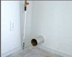
old way / direct vent