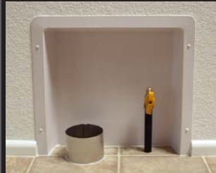
DBX900 / down vent