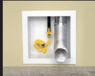
DBX1000 / up vent