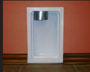
DBX1000M / up vent