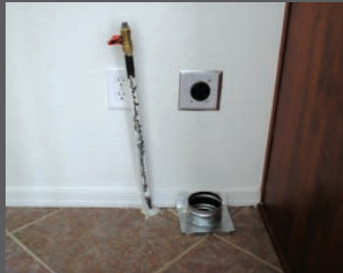
old way / down vent